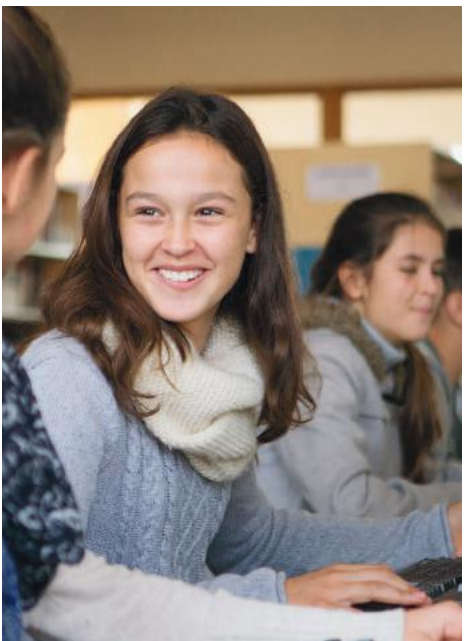
Lycée/Senior High School

Years 6 to 9 In Junior High School, students reinforce and increase the knowledge they have acquired in elementary school. They are also introduced to secondary education teaching methods as they prepare for the National Diploma Brevet (DNB). The Loi d’Orientation et de Programmation guarantees that by the end of Year 9 all students will have acquired a common base of competencies and knowledge. At the end of junior high school students must sit the national Brevet diploma exam. In Year 6, students also have the option to begin learning a second foreign language.