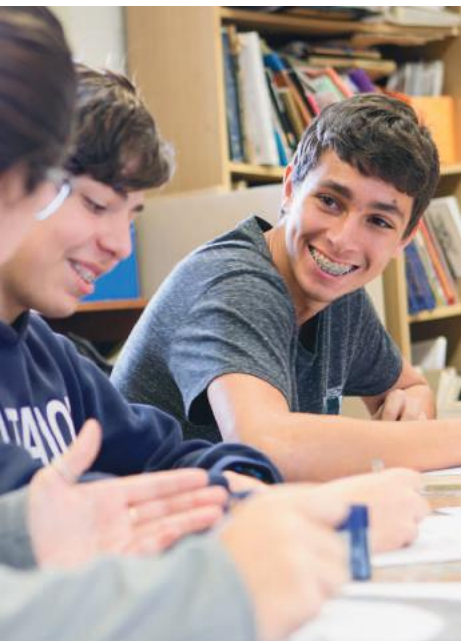
The French Baccalaureate (FB)

Seconde • Première • Terminale/Years 10 to 12 Lycée Condorcet Sydney offers two different curriculums for Senior High School and to qualify for higher education: the General or French Baccalaureate OR the International Baccalaureate.