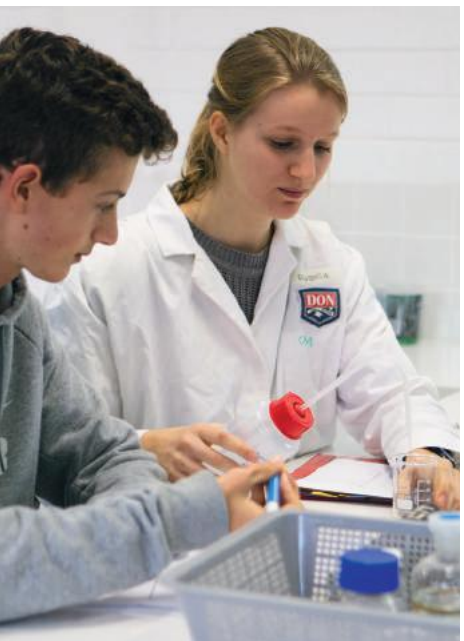
The International Baccalaureate (IB)

The General or French Baccalaureate (FB) of the French Ministry of Education is recognised internationally and allows students access to higher education in France, Australia and the rest of the world, including preparatory classes. The syllabus is studied over three years from Year 10. The curriculum aims to allow for gradual specialisation and conscious preparation for the student’s choice of tertiary study and promote the learning of modern languages, appreciation of the arts and culture and accountability.