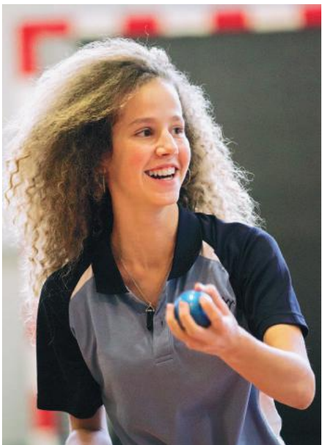
College/Junior High School

CP to CM2/Years 1 to 5 Our elementary school focuses on the written language (Years 1–3) and consolidation of knowledge (Years 4–5). The basic concepts introduced in Maternelle are reinforced with a focus on proficiency in written and spoken French and English. In Years 1 to 3 (cycle 2, fundamental learning) children are introduced to French and English, mathematics, discovery activities, the visual arts, music and physical education. In Years 4 and 5 (cycle 3) other subjects are studied in more detail: literature, history and geography, experimental science and technology. Information and communication technology skills are required for many other school activities and lead to the first level of the computer and Internet component of the Brevet which is the equivalent of the School Certificate.