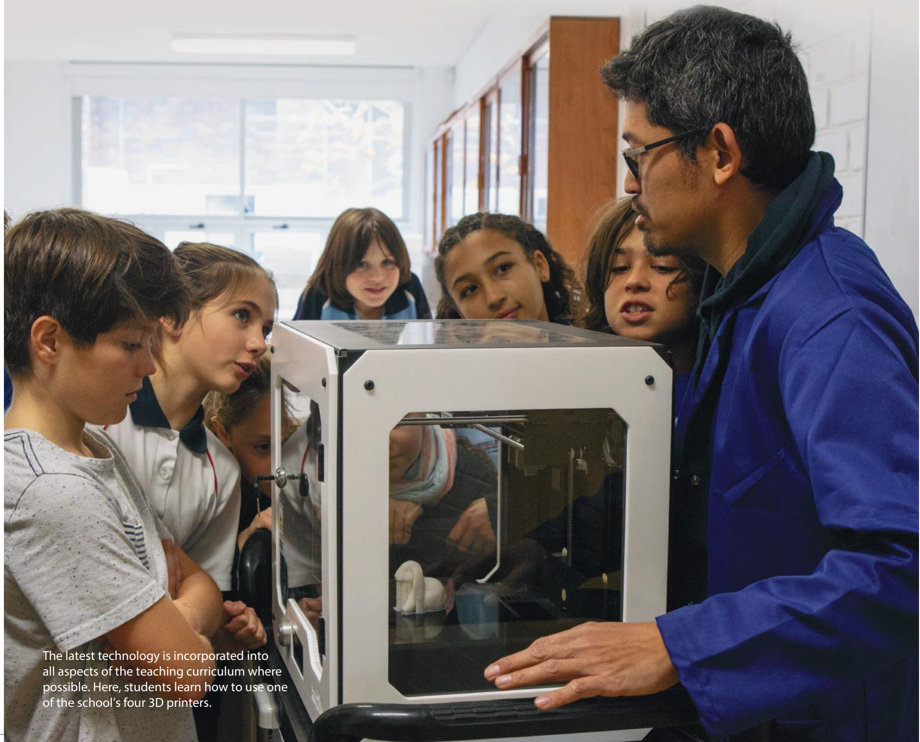
The latest technology is incorporated into all aspects of the teaching curriculum where possible. Here, students learn how to use one of the school's four 3D printers.

The school's focus on a well-rounded education in a diverse, friendly and nurturing environment makes LCS an incomparable and forward-thinking choice for your child's education.