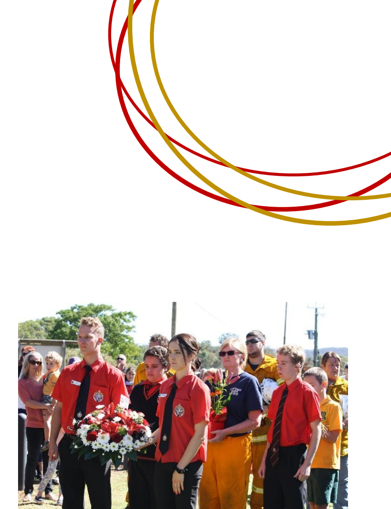
ANZAC Service in Bindoon Town