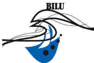
Bilu means big river and is BLUE

During 1999 the Houses were given names taken from the Noongar language to represent each of the four elements that are important in Aboriginal Culture.