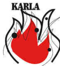
Karla means fire and is RED