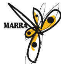
Marra means sky or wind and is YELLOW