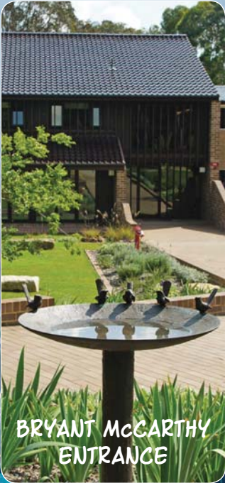
BRYANT MCCARTHY ENTRANCE